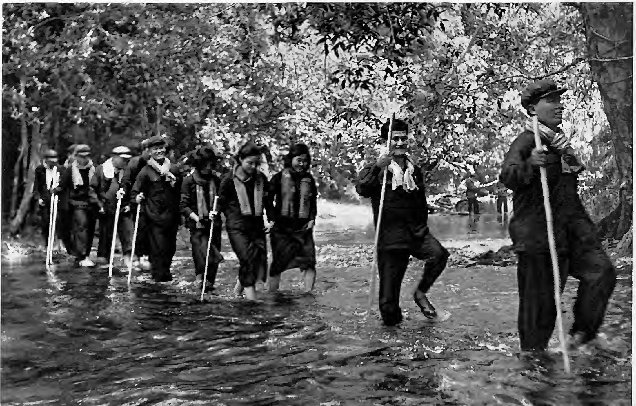
Madame Sihanouk crossing a stream. Supporting her on the left is the wife of Hou Yuon, Minister of Interior, Rural Reform and Co-operative.